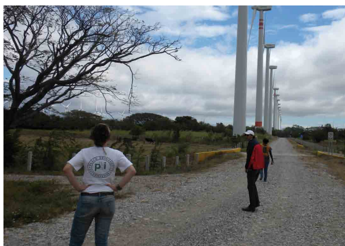
Oaxaca Team volunteer with civil society representatives concerned about the wind turbines on the Isthmus of Tehuantepec