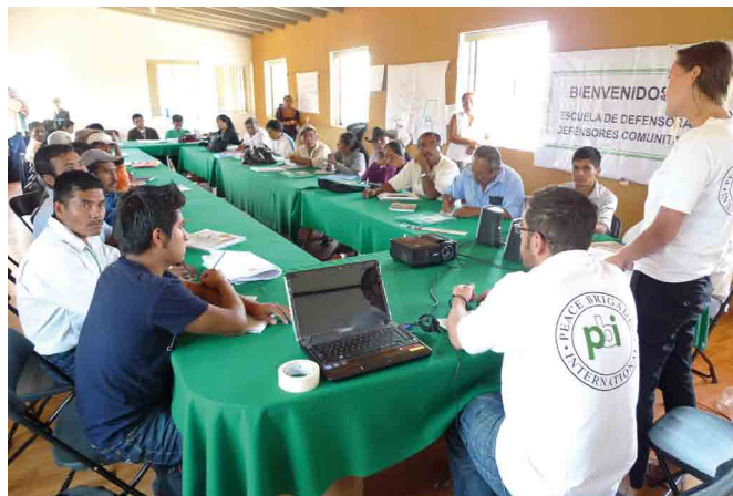
PBI team members giving a security workshop to community human rights defenders in Oaxaca

Despite these successes, the number of attacks against HRDs, and the number of requests for consultancies (in security and advocacy) show that the challenges continue to be great. PBI is convinced that both programs can have an important role in the strengthening and protection of human rights defenders in Mexico.