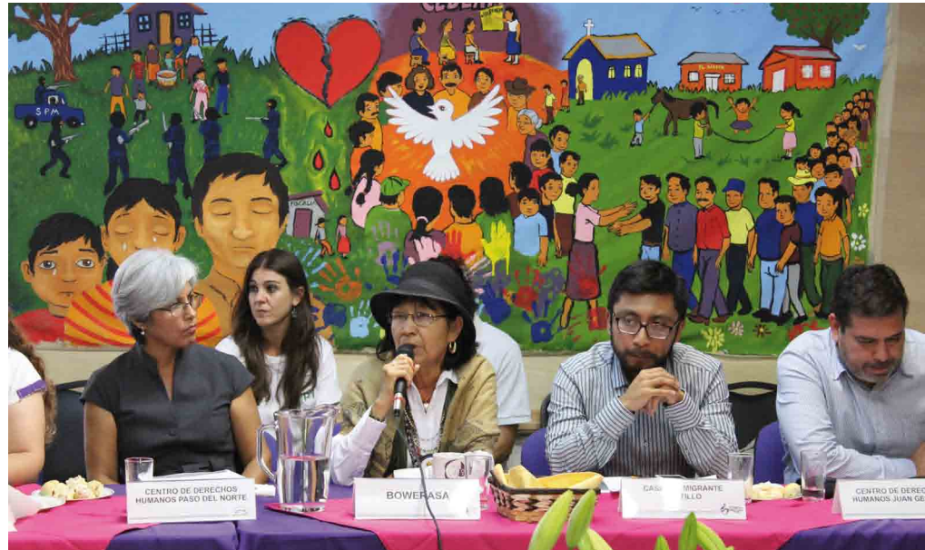
Event to celebrate the launch of the new Northern Team in Chihuahua, October 2013

Local organizations expressed the need for training in political advocacy, and PBI began designing a program of consultations focusing on advocacy and building support networks. This new tool reflects PBI's mandate to share strategies that can empower local civil society actors, and broaden their “space” for action. The program will be stepped up in 2014 to allow more HRDs to benefit.