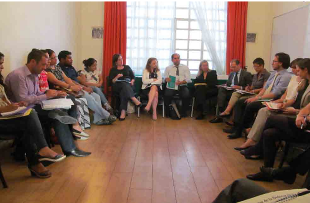
Meeting between HRDs and the diplomatic corps at the launch of A Panorama of the Defense of Human Rights in Mexico: Initiatives and Risks of Mexican Civil Society

which delivered a joint analysis of the human rights situation, as well as proposals for recommendations. PBI considers it positive that more than one third of the 176 recommendations Mexico received in the UPR concerned human rights defenders. Various countries expressed their concern for the risky security situation of HRDs, and requested that the Mexican government strengthen their protection and take measures to avoid attacks against them. Mexico has until March 2014 to accept the recommendations; PBI considers it crucial that the Mexican government adopt and act on the recommendations, in order to support and legitimate HRDs.