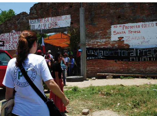
Oaxaca Team volunteer at the Isthmus of Tehuantepec, at the International Megaprojects Seminar on Energy and Indigenous Territory "The Isthmus at the Crossroads"

Amnesty International – Swedish Amnesty Fund (Sweden) Basilian Fathers – Human Development Fund (Canada) Bread for the World / Brot für Welt (Germany) British Embassy in Mexico – Foreign and Commonwealth Office Campbell World Fund (Canada) Canadian Embassy in Mexico – Canada Fund for Local Initiatives Canton of Basel (Switzerland) Civil Peace Service (German Federal Ministry for Economic Cooperation and Development) Dutch Embassy in Mexico Fedevaco: City of Renens (Switzerland) Fedevaco: City of Rolle (Switzerland) Institute of International Affairs (ifa), Zivik Programme (Civil Conflict Resolution) (German Federal Foreign Office) MacArthur Foundation (United States) Maya Behn-Eschenburg Foundation (Switzerland) Misereor (Germany) Non Violence XXI (France) Norwegian Embassy in Mexico OPSEU – Ontario Public Service Employees Union (Canada) Overbrook Foundation (United States) Paris Bar Association (France) PBI Country Groups (Italy and UK) Protestant Church Saint Gallen-Tablat (Switzerland) Santander Municipality (Spain) Sigrid Rausing Trust (UK) Solidarity International (Switzerland) Swiss Embassy in Mexico Valladolid Municipality (Spain) Valladolid Provincial Council (Spain)