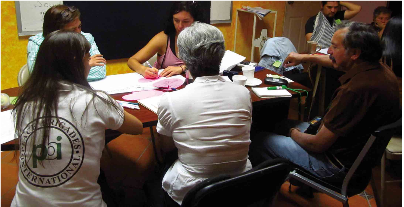
PBI delivering a workshop to HRDs in Ciudad Juárez, Chihuahua