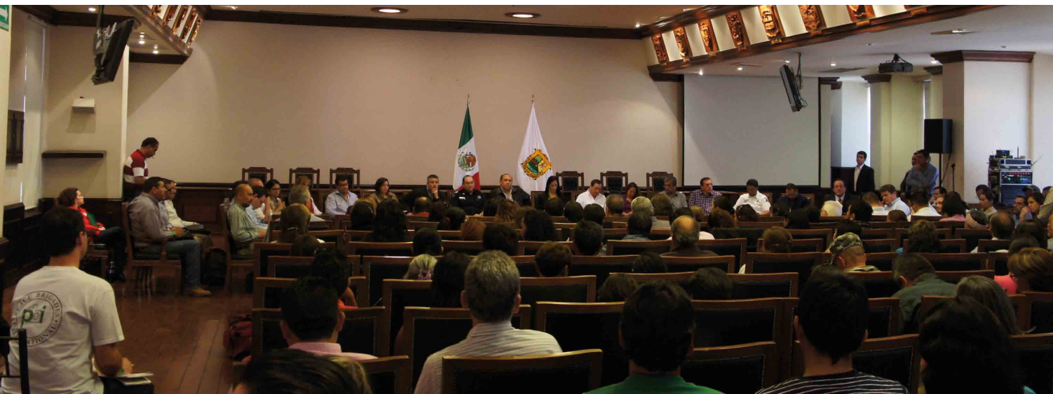
PBI in Saltillo, accompanying the meeting between families of FUUNDEC and government representatives, in which they discussed conducting searches for those who have been forcibly disappeared

With the conclusion of the exploratory mission in 2012, and the decision to open a new field team in the country's north, PBI Mexico focused on beginning accompaniment work in the states of Chihuahua and Coahuila in 2013. Both states have been identified as among the most dangerous for the defense of human rights 21 . PBI has documented attacks, threats, harassment, surveillance, physical aggression, and criminalization against human rights defenders (HRDs) as a result of their work. In only two years, five women activists were murdered in Chihuahua and another 12 left the country because of death threats 22 .