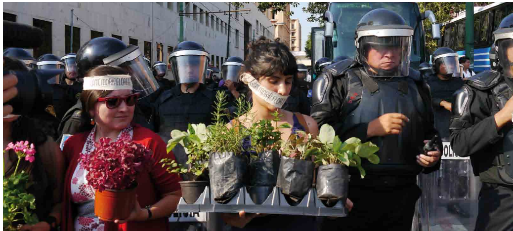
Protest held on October 2 in Mexico City

The year 2013 was marked by strong social protests across Mexico. In the Federal District, an increase in the violent repression of protests was noted, as occurred on October 2 when more than one hundred protesters were detained 9 . Because of this occurrence, the Inter-American