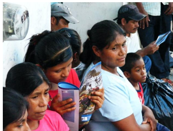
Activists relatives of OPIM defenders detained in Ayutla prison reading a PBI's bulletin "Silenced", Ayutla, Guerrero, August 2009.