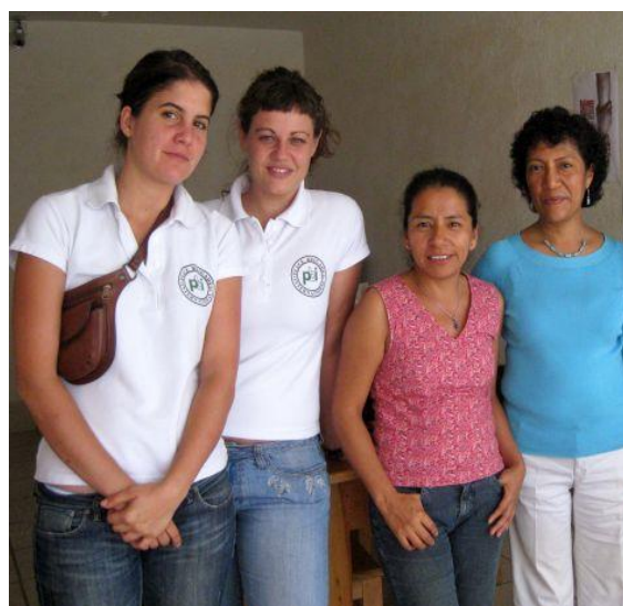
PBI volunteers with members of the 25 November Committee in Oaxaca, in November 2010.

I have been in Mexico since then, working as a volunteer with PBI and learning about and accompanying men and women human rights defenders in Oaxaca. I'm happy to see the fruits of their work to win justice or a more dignified life for others, but I also see the danger they face just for defending human rights. To know people who dedicate – and sometimes even risk – their lives for the rights of others is something that can truly change your life.