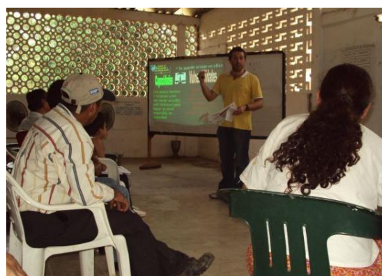
PBI security workshop with AFADEM members in Atoyac, Guerrero, in September 2010.

In 2010, PBI trained 115 men and women HRDs from 10 organisations who work on various issues, including indigenous rights, the struggle against impunity and migrants' rights. Grassroots groups working in rural areas have received training, as have organisations running some of Mexico's most emblematic cases and the regional offices of large international bodies.