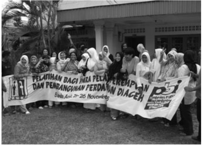
27 Flower Aceh counselors and community organisers attended a workshop to establish local trainers skilled in peace-building, gender issues, and nonviolent conflict transformation who could apply these skills within their communities.

19 volunteers in Jakarta, Aceh, and Wamena and Jayapura, Papua, four paid staff in Indonesia and one in Canada, 26 volunteers on the Project Committee and subcommittees.