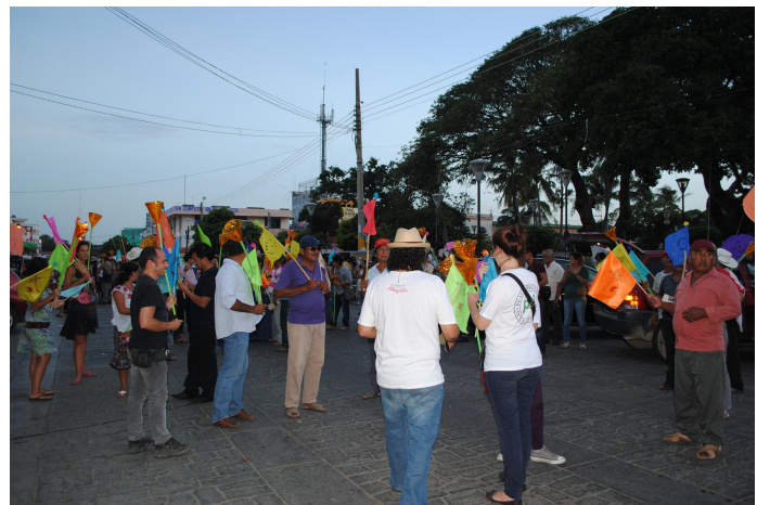
PBI volunteer with a member of EDUCA during the “march for peace” in the Isthmus of Tehuantepec

EDUCA publishes daily news in its Minuta and broadcasts through their radio station Espejos . They also publish a quarterly analytical bulletin called El Topil , as well as information campaigns and many other publications, such as books, reports etc. A few months ago they launched the campaign Defendiendo Derechos Sembramos Futuro (by defending rights we sow the future) to raise the profile of the work of community human rights defenders.