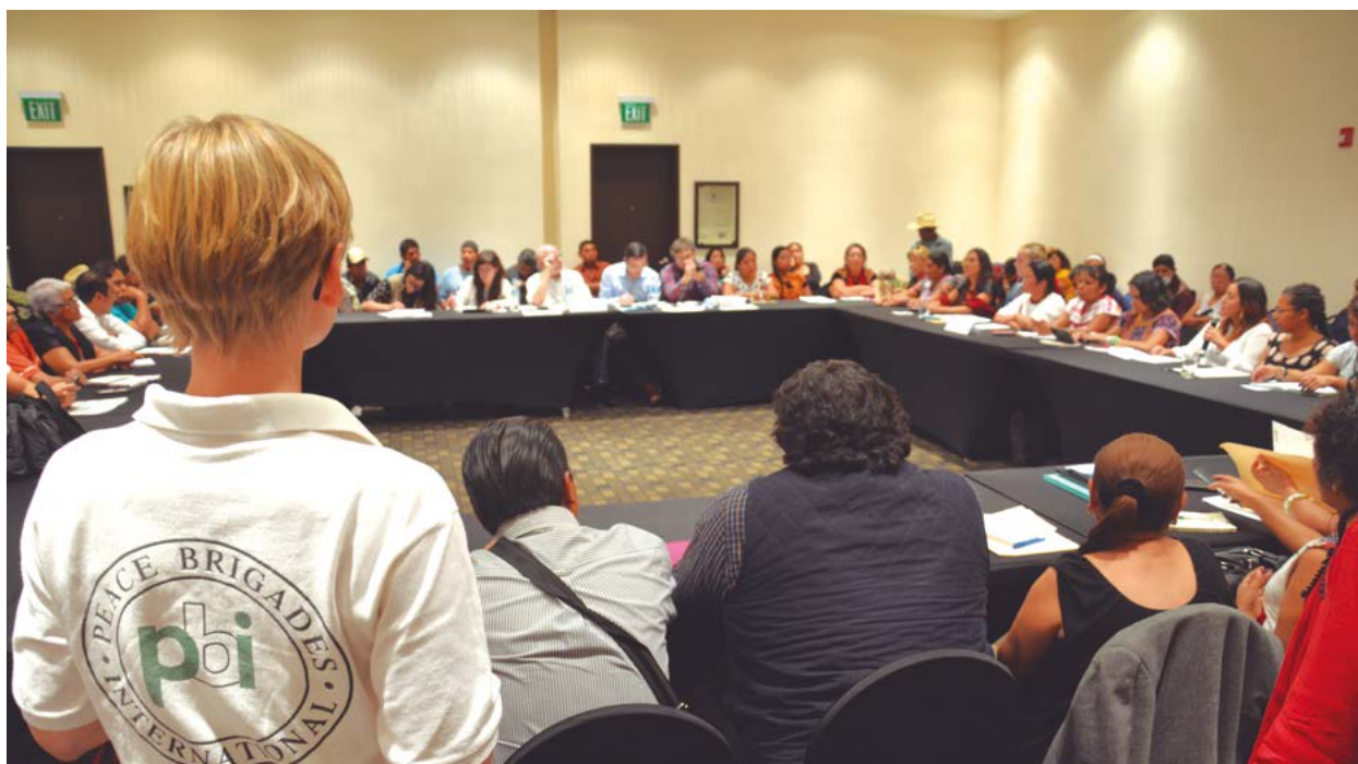
Meeting of HRDs and Michel Forst, Oaxaca