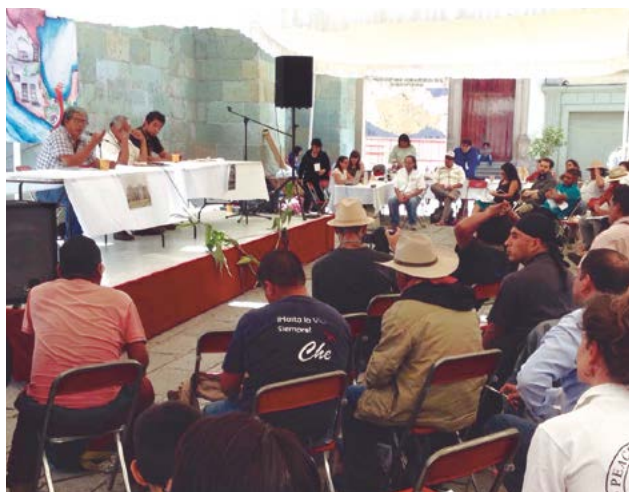
Forum “Special Economic Zones, community life and environment”, Oaxaca