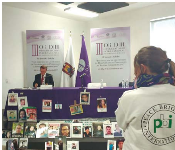
Forum "The rights of victims of disappearances of persons in the Inter-American system", Coahuila

bodies that have been discovered hitherto in the State of Coahuila and recover those that are yet to be found 52 . In order to support this advance, and contribute to its success, PBI has emphasised the importance of implementing all the procedures set out in the law, and of ensuring both the security of the family members of victims but also – by establishing dialogue with different state authorities – their active participation.