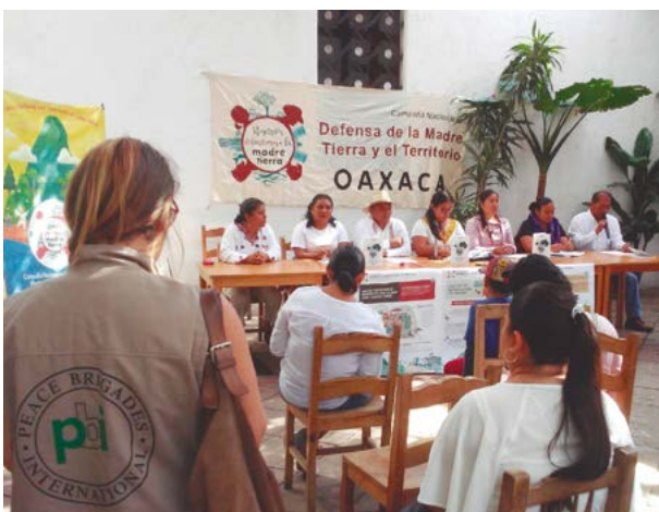
Closing event of the National Campaign on the Defence of Mother Earth and territory, Oaxaca