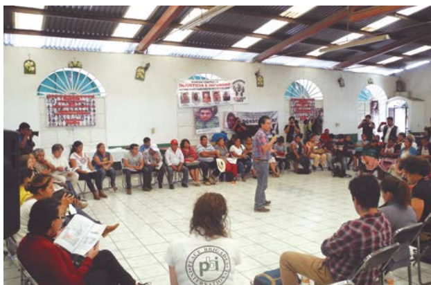
Meeting of victims in Chilapa during the Observation Mission, Guerrero