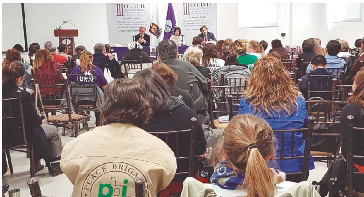
Forum “The rights of victims of disappearances of persons in the Inter-American system”, Coahuila